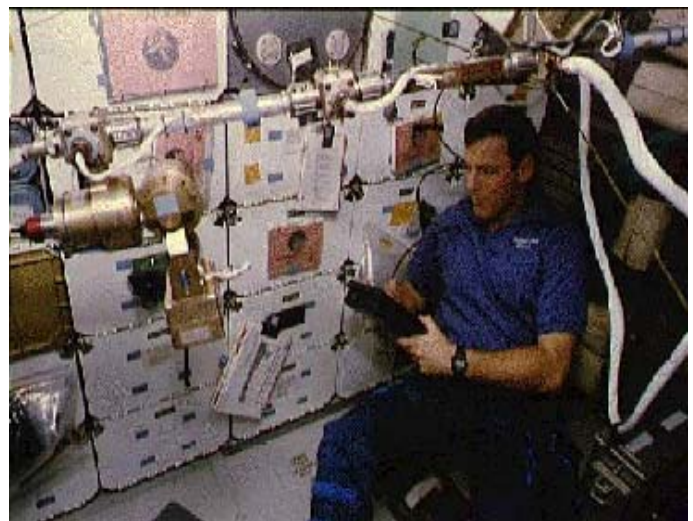
In-Flight Operation on STS-67

The MACE project will lead to many military advances. Some of these include increased stability/pointing accuracy, reliability and survivability, and reduced design/validation costs required for military missions like surveillance and threat warning, target detection, and satellite communications.